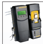
MicroDock II compatible