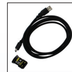
IR connectivity kit