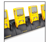
Five unit cradle charger

For a complete list of accessories, please contact BW Technologies by Honeywell.