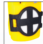
Auxiliary filter kit