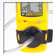
Simple calibration and bump testing