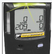
Black housing available