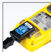
Easily download datalogged info